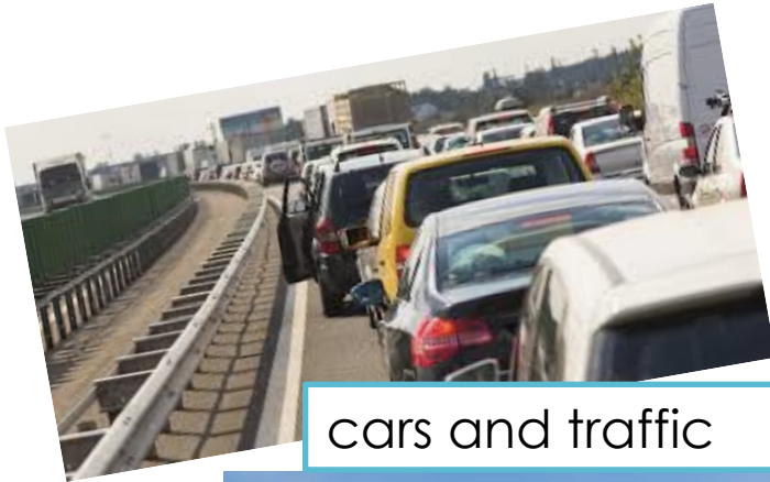
cars and traffic

What kinds of things will your main character see in the modern day? Look at my examples below to spark your imagination.